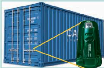
Records shock and vibration history in shipping containers